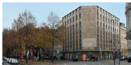
Privat student dorms of RWTH International Academy